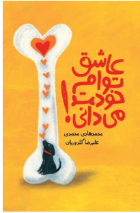
Illustration Alireza Golduzian

This is a symbolic story of the paradoxes of love. Sometimes, children become so engrossed in their toys that they cannot bring themselves to giving them up even for a moment. As they grow up and make a friend, they want that friend to be only theirs. Even when they are grown-ups, the anxiety and the preoccupation of losing a relationship stays with them. In truth, you do not achieve what you like easily; and friendship are hard to get, and when you