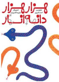
Illustration Alireza Golduzian

get it, you are always anxious to keep it somewhere inaccessible. But is there anywhere in the world which is inaccessible?